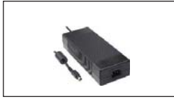
Power Supply Unit (PSU)