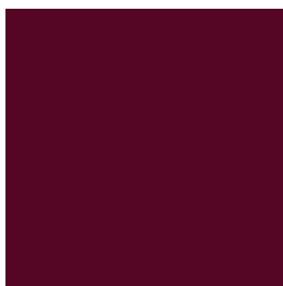
Burgundy Red K170