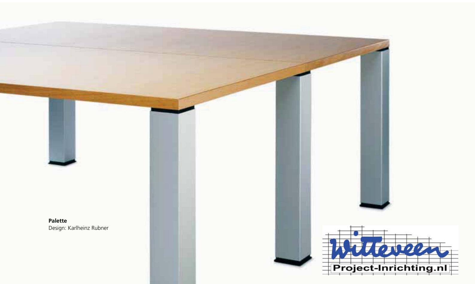
Palette Design: Karlheinz Rubner

The rigid blockboard tops do not require any underframes. This creates more legroom and allows space-saving stacking (like pallets) of any tabletops not currently needed. And what is more, in addition to mass-produced tabletops, the ingenious design allows customised tabletops – including integration of state-of-the-art multimedia equipment.