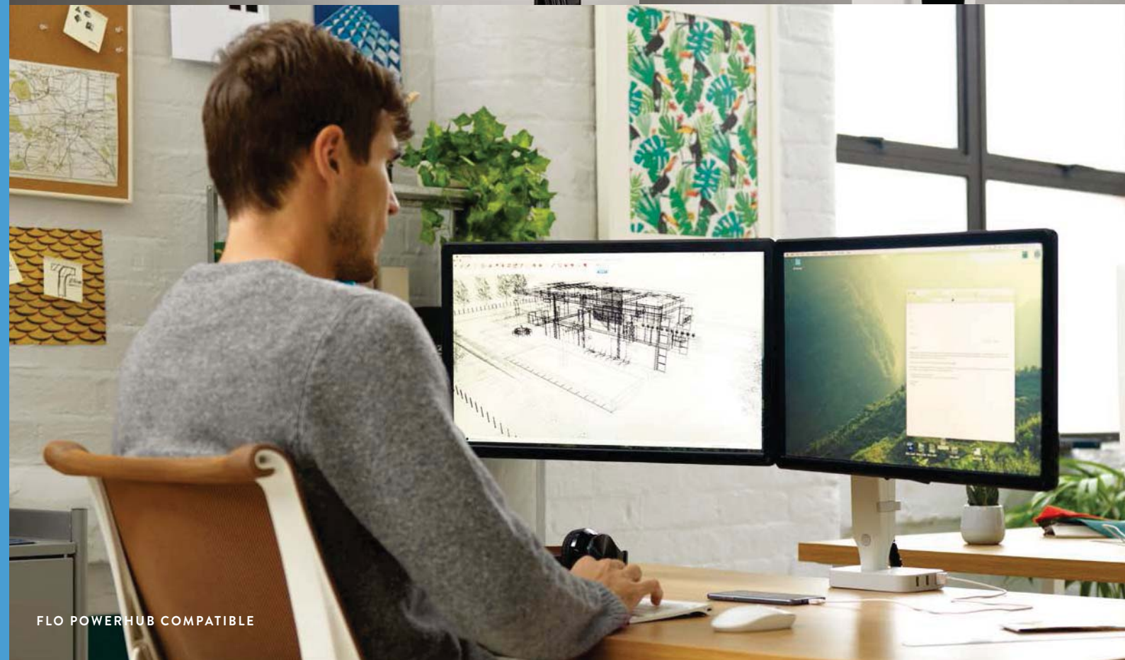
FLO POWERHUB COMPATIBLE