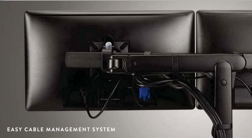
EASY CABLE MANAGEMENT SYSTEM