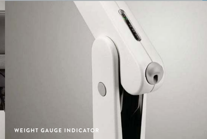
WEIGHT GAUGE INDICATOR