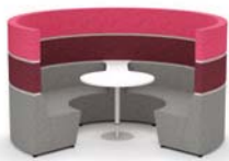
90° modular pod with pod table