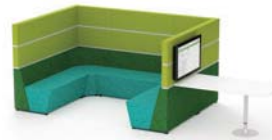
Square U-shape with integral media screen & cantilever table