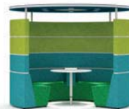
90° modular pod with canopy & pod table