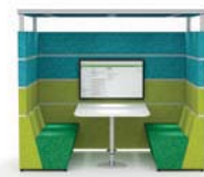
Rectangular pod with canopy & rectangular pod table