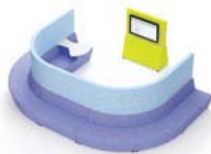
Curved U-shape with fan table & free-standing media screen