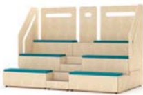
12 Seat Configuration