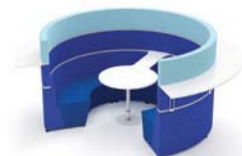
90° modular pod with workshelf & pod table