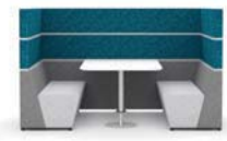
Rectangular pod, 2 screens high, with integrated rectangular pod table