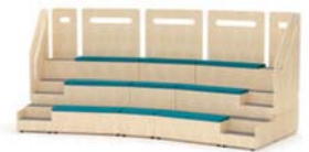
16 Seat Configuration