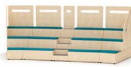
20 Seat Configuration