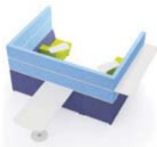
Square U-shape with internal rotating tables, cantilever table & workshelves