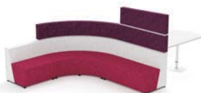
Stepped L-shape with cantilever table