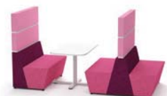
1200mm booth with integral table