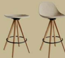
Mate Spin Wood 65 and 75 cm high