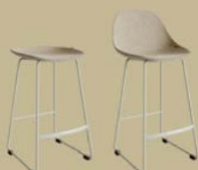
Mate Sledge 65 and 75 cm high