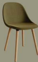
Fully upholstered shell