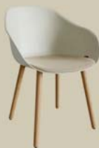
Polypropylene shell + upholstered seat pad