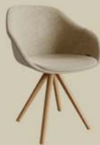
Lore Spin Wood