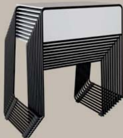
10 Tema tables