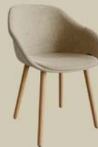
Fully upholstered shell