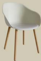
Polypropylene shell + polypropylene seat pad