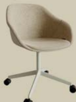
Lore Confident with castors