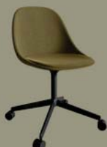
Mate Confident with castors