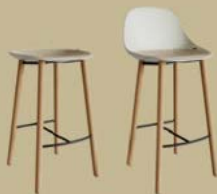
Polypropylene shell + upholstered seat pad