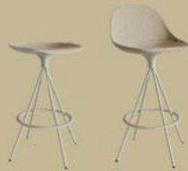
Mate Spin 65 and 75 cm high