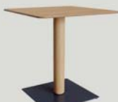
Square top & base 73 cm high