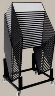
20 Tema tables with trolley