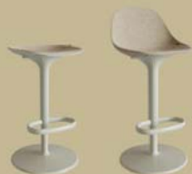
Mate Lift 66-79 cm high