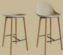
Mate Wood 65 and 75 cm high