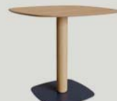
Oval top & base 73 cm high