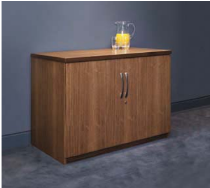
Lockable credenza unit in Black American Walnut crown cut veneer with brushed aluminium bow handles. Size 1000mmW x 600mmD x 720mmH