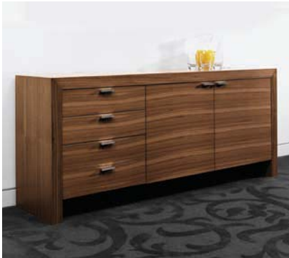
Credenza unit in Black American Walnut quarter cut veneer with brushed aluminium profile handles. Size 1800mmW x 450mmD x 750mmH

Matching credenzas can be supplied to accompany your Apollo table. These are available in range of sizes, shapes and finishes. Contact your Boss representative for further information.