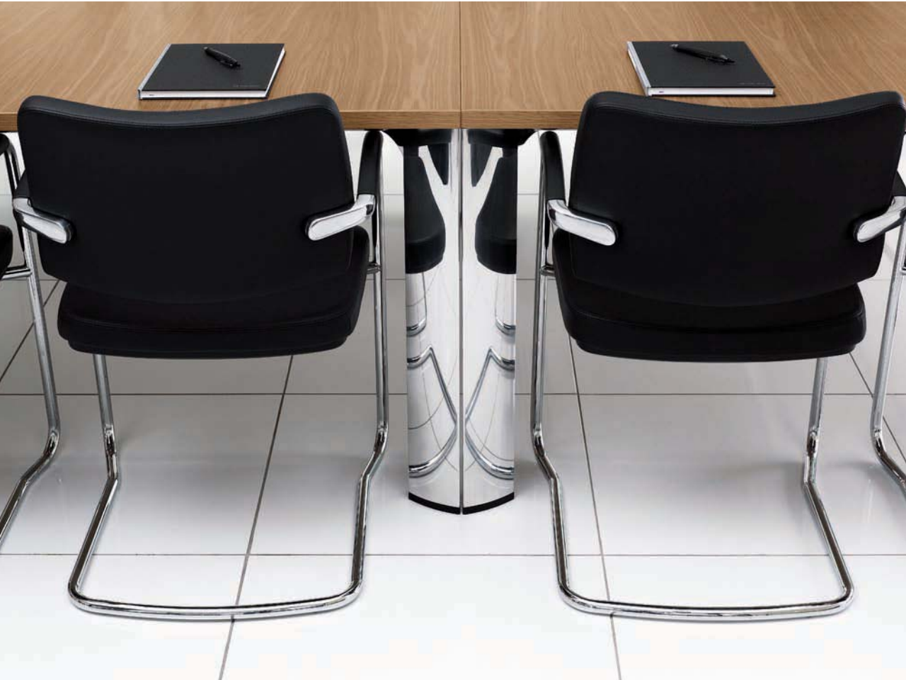
This image shows two 1500mm x 1500mm Apollo tables linked together.