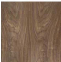
Black American Walnut