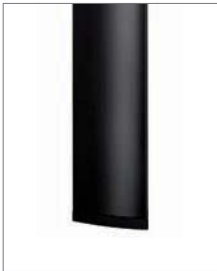
Black leg with black adjustable foot