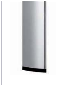
Chrome leg with black adjustable foot (supplied with polished frame)