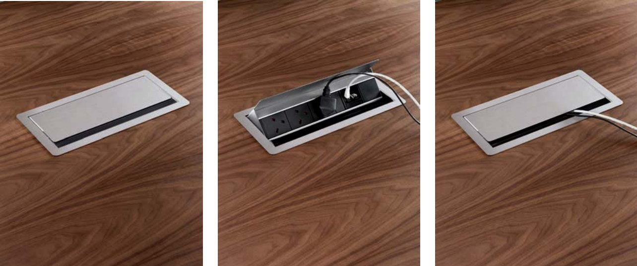
2 power and 2 data is the standard power and data offer from Boss Design.