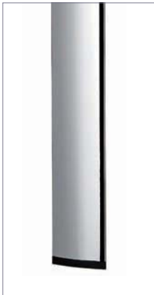
Polished leg with black adjustable foot