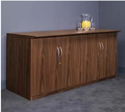
Lockable credenza unit in Black American Walnut laminate with brushed aluminium bow handles and chamfered front edge. Size 1600mmW x 670mmD x 720mmH