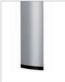
RAL 9006 leg with matching adjustable foot