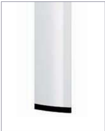
White leg with black adjustable foot