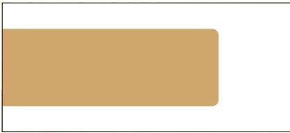
Square edge detail