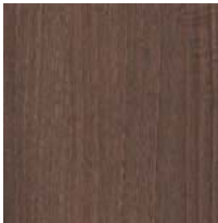
Black American Walnut