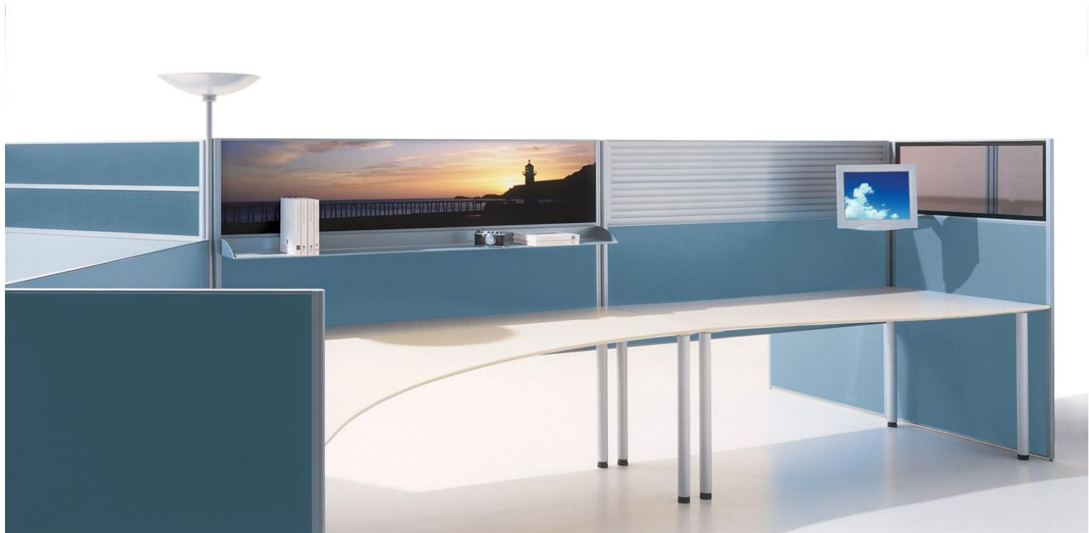
Elevation 25mm screens