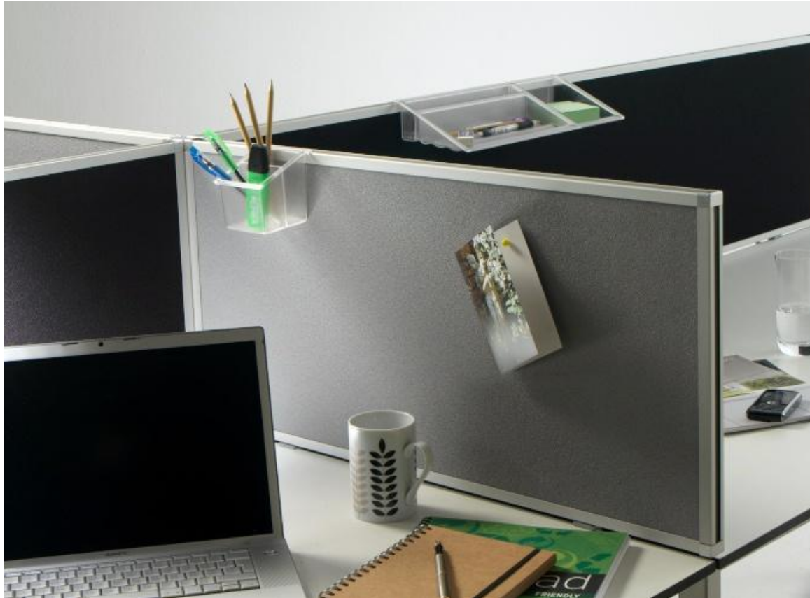
Element 25mm pinnable screens