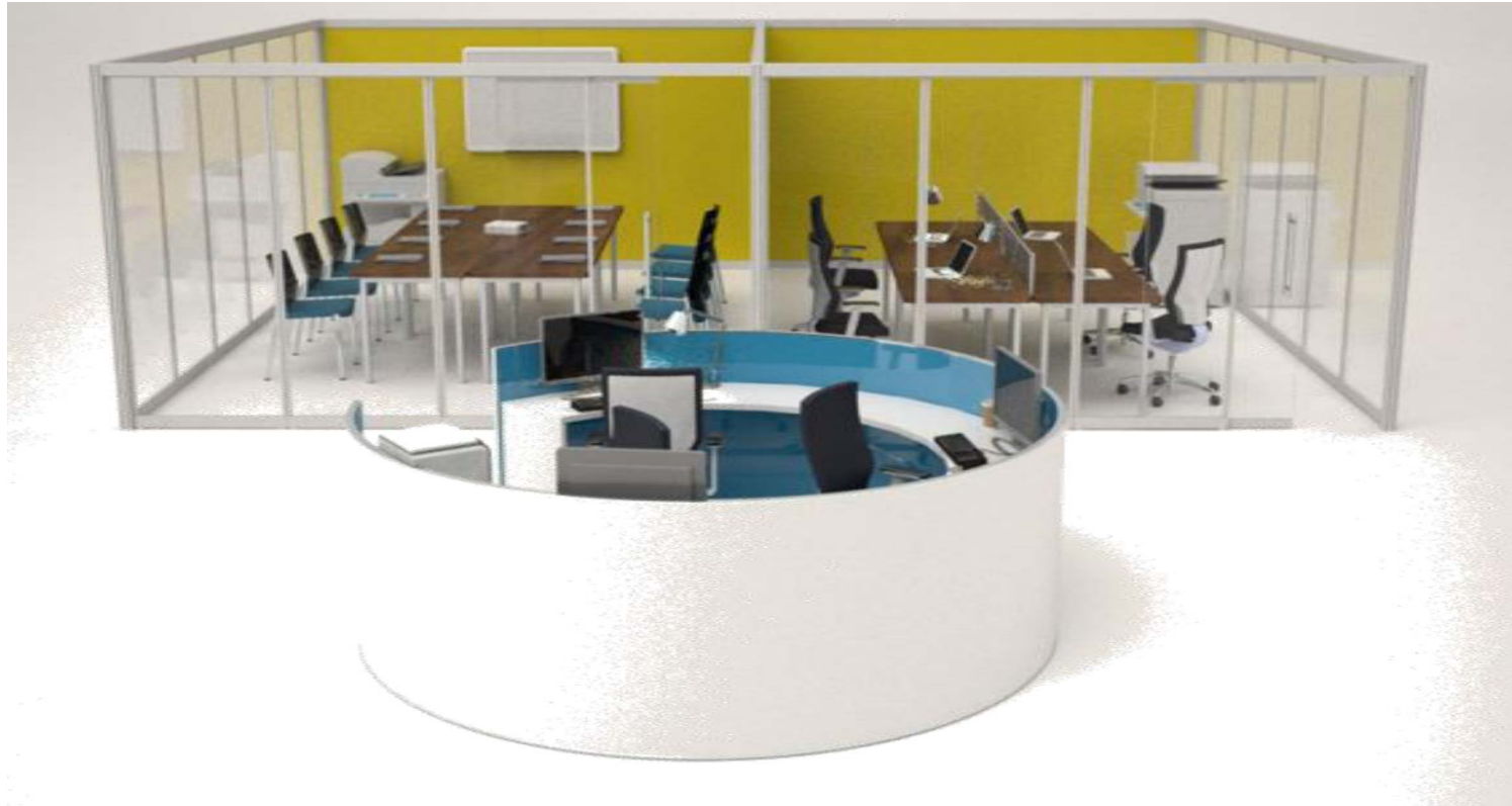
Freestanding reception and meeting rooms