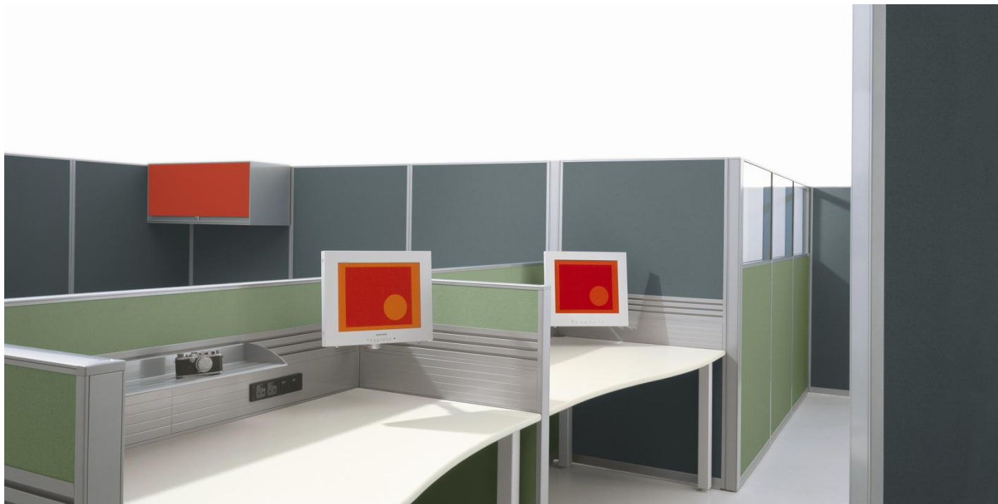
Addition 65mm cabled managed screens