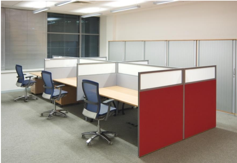
Reflection 35mm screens