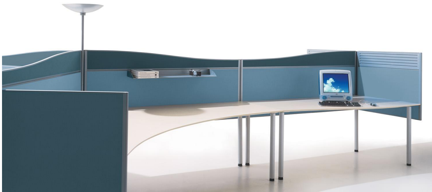
Elevation 25mm screens