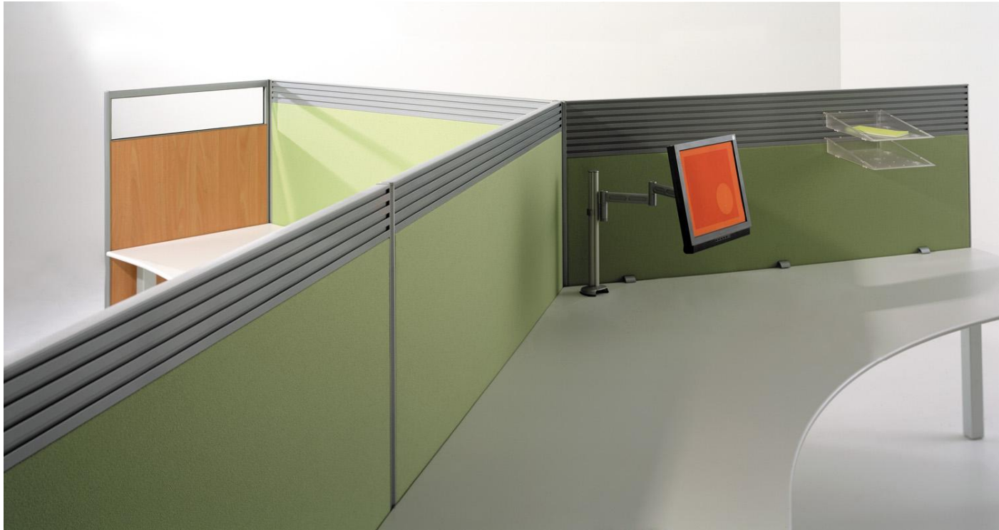
Attraction 30mm screens