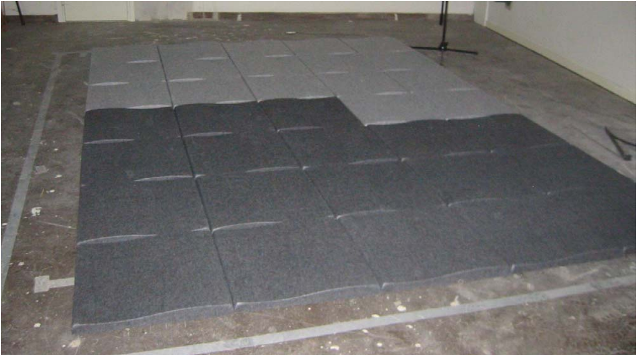
Wall panels mounted on the floor of the reverberation room.

The specimen was mounted on the floor of the reverberation room in conformance with ISO 354:2003 Annex B. The specimen pieces was mounted so that a single row creates waveform.